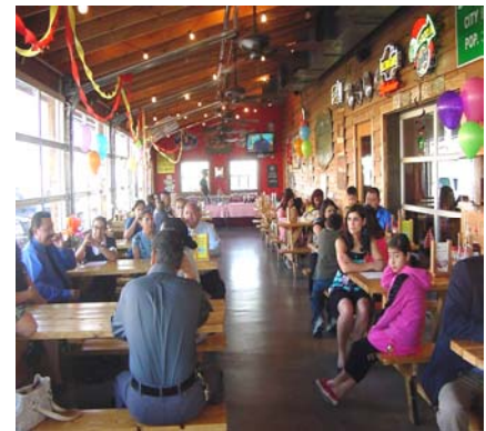
Volunteer Recognition Dinner 2009 at Rudy's Bar-B-Q

"Never doubt that a small group of thoughtful, committed citizens can change the world; indeed, it's the only thing that ever has." -Margaret Mead